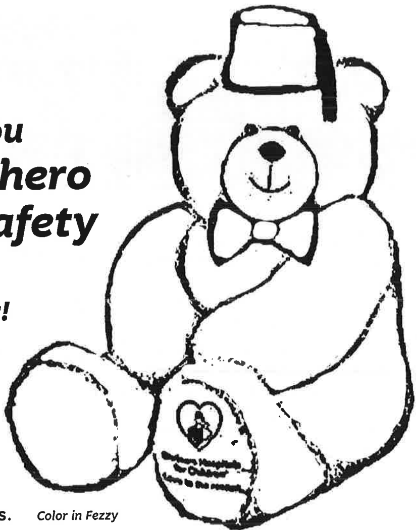
Color in Fezzy