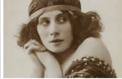
Anna Pavlova (ballet legend)