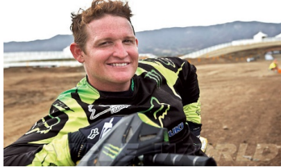
Ricky Carmichael (motocross legend)