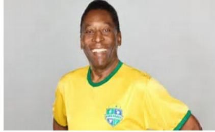
Pele (soccer legend)