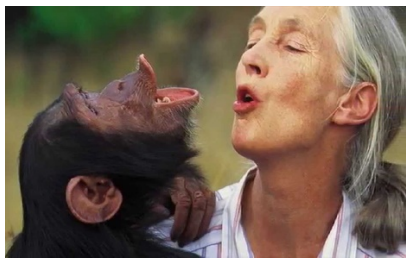
Jane Goodall (scientist)