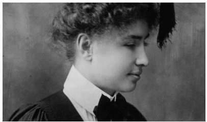
Helen Keller (disability pioneer)