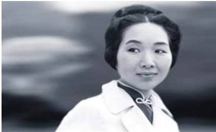
Michi Weglyn (Japanese Internment Camp survivor)