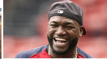
David Ortiz (MLB legend)