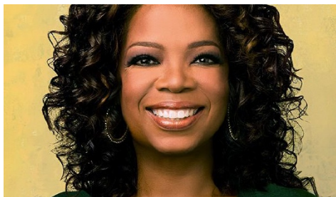
Oprah Winfrey (Television mogul)