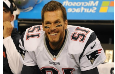
Tom Brady (NFL legend)