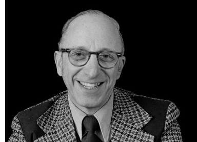
Ralph Baer (Inventor of video games)