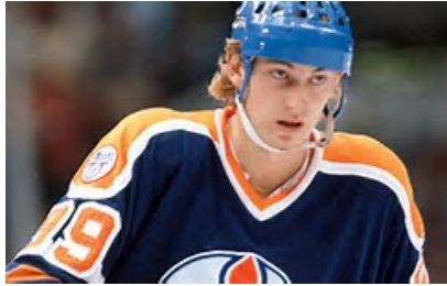
Wayne Gretzky (NHL legend)