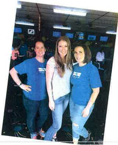
"Thank you to the Erving Recreation Committee for generously sponsoring the very successful and immensely fun 100 Mile Club Bowling and Pizza Party".